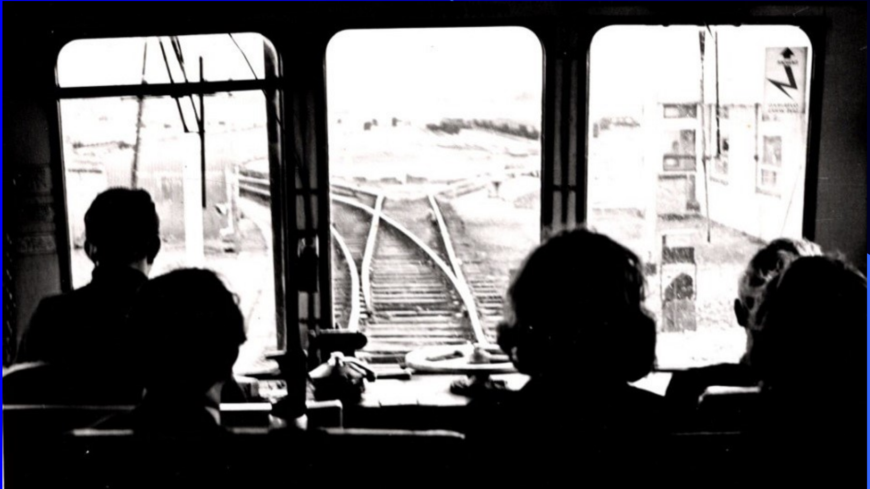
View from top of the hump