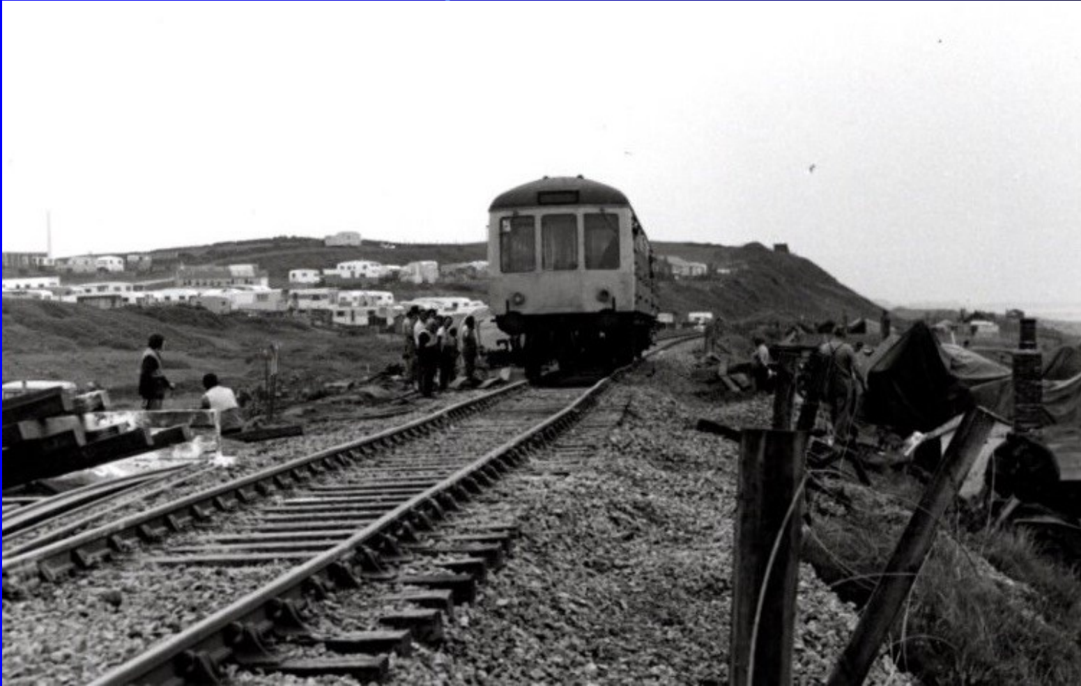
First train over the re-laid formation