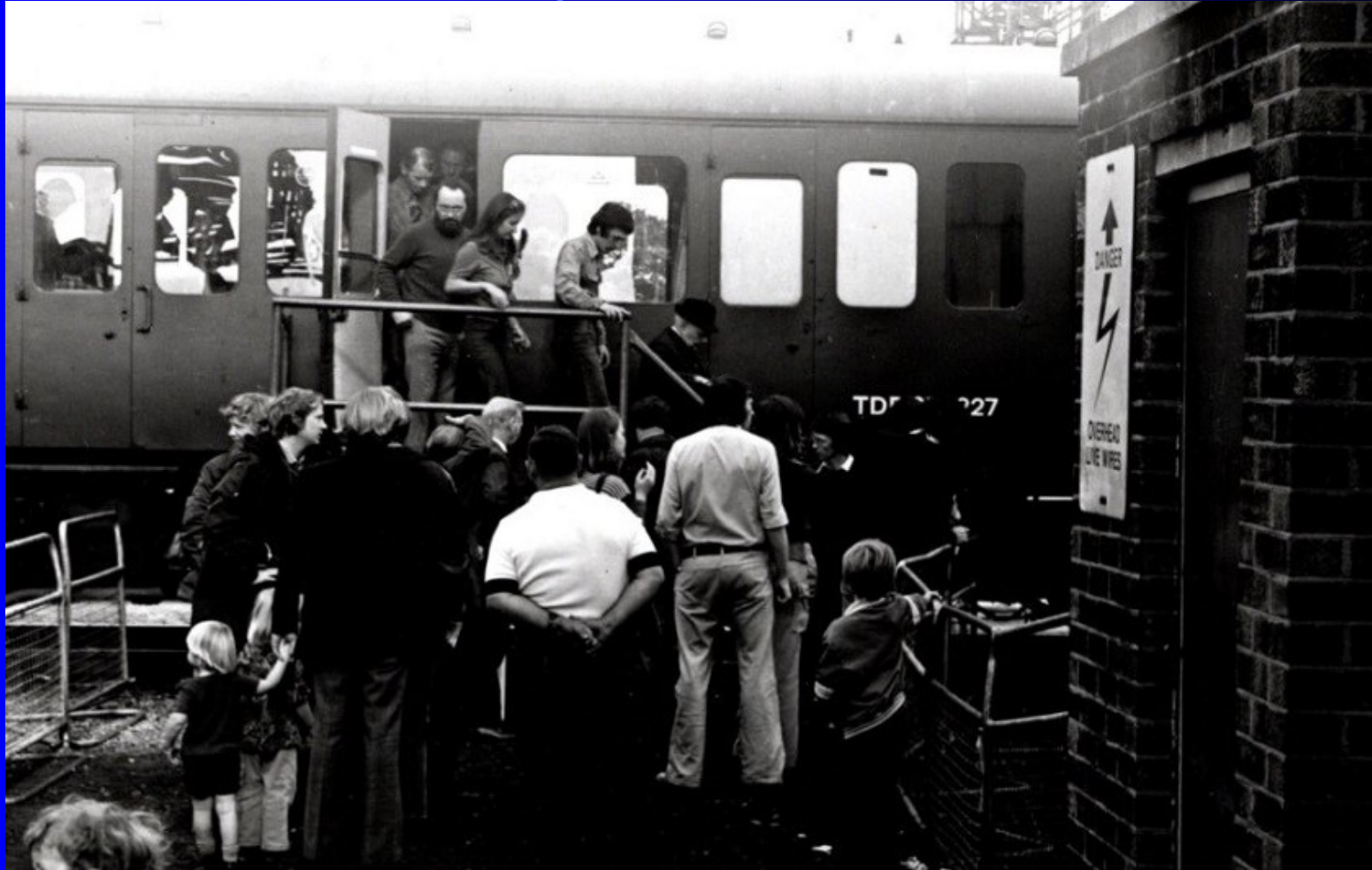
The queue waiting to board